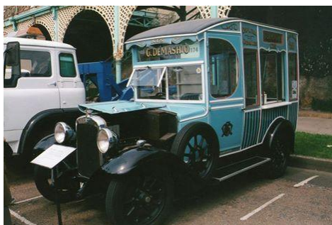
The original van, recently restored